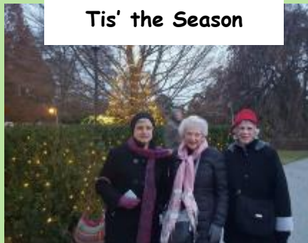
Tis' the Season