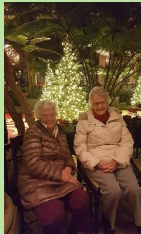
Two Peas in a Pod