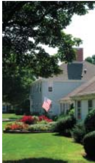
the charm of colonial New England